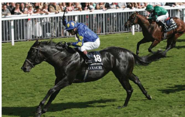
WINNER - GROUP 1 COOLMORE NUNTHORPE STAKES, YORK