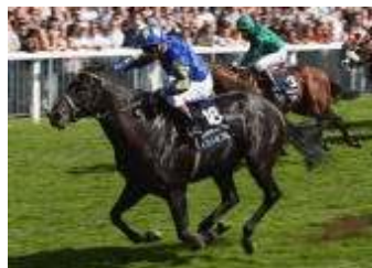
Kingsgate Native