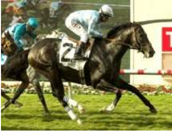
After Market

It wasn't flashy. It wasn't sparkling. Smoking favorite After Market (Storm Cat) didn't have to be either of those things to collect his fourth consecutive victory in Sunday's GII Del Mar H. Content to track the early pace set by Obrigado (Fr) (Enrique {GB}), the handsome dark bay forged to the front in the final sixteenth and was well within himself to post a 3/4-length victory over the rail-skimming closer Runaway Dancer (Runaway Groom). cont. p2