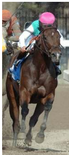
INDIAN FLARE 2002-2007

Indian Flare (Cherokee Run), who led the way through a crisp opening half mile in yesterday's GI Ballerina S.,