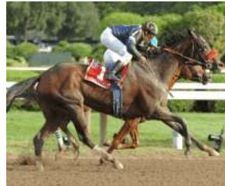
Maryfield

Maryfield (Elusive Quality) made the most of a salty early pace to collect her first Grade I victory in Sunday's GI Ballerina S. at Saratoga. Settled in a stalking fifth while Indian Flare (Cherokee Run) and Baroness