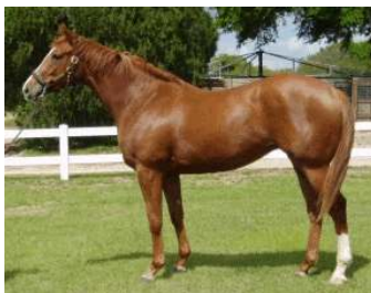
The picture of A to the Croft that McPeck sent to Harrison