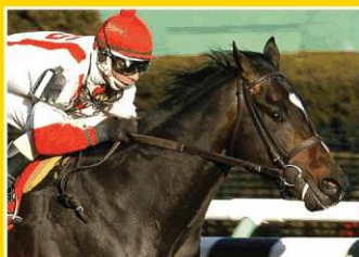
SUMMER DOLDRUMS-G3 2007 multiple stakes winner

More Graded SWs of 2006/2007 than all but three much larger consignors