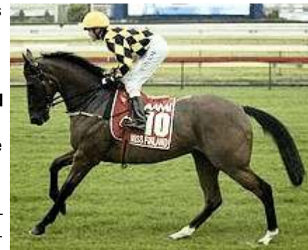
Miss Finland

An 11th-hour decision by both the South Australian and Victorian governments Friday afternoon that lifted the travel ban in those states allowed champion Miss Finland (Aus) (Redoute's Choice {Aus}) to leave her home base in South Australia Friday night and ship to Caulfield to contest yesterday's star-studded G2 Memsies S. The