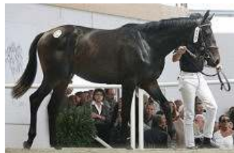
Hip 173 Baden-Baden photo