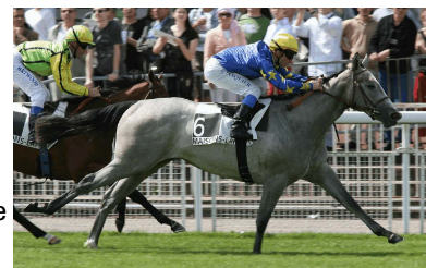
Natagora