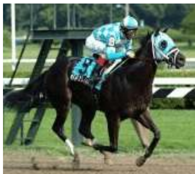
Ready's Image

Ready's Image had blinkers added for the Tremont S. at Belmont July 1 and responded with a 7 3/4-length tally. He added an impressive four-length score in the