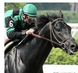
Cable Boy

Cable Boy rattled off three straight scores, including the June 24 Coronado's Quest S. June 24. The handsome colt lost his unbeaten record when he finished fifth after setting the pace in the GI Haskell Invitational Aug. 5 at Monmouth, and was diagnosed with the thumps afterwards. He has been training smartly in the interim. Stablemate Get Serious showcased his versatility by finishing second to First Defence in the Long Branch S. July 14 prior to a sharp success in a Monmouth turf allowance going nine panels Aug. 19. Zanjero returned from a 2 1/2-month break to defeat Bwana Bull by a nose in the GIII West Virginia Derby Aug. 4 at Mountaineer, with Moyer's Pond six lengths back in third that day. A pair of graded-stakes winners this spring, Slew's Tizzy and Cowtown Cat , look to rebound after disappointing in their last starts. The former faded to finish a distant seventh in the West Virginia Derby, while Cowtown Cat was a non-threatening fourth in the GII Jim Dandy S. July 29 at Saratoga.