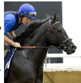
Danak - 1/2 to yesterday's topper, hip 269