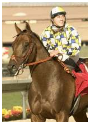
Salute the Sarge Benoit

Undefeated Salute the Sarge (Forest Wildcat), who has the distinction of being the only graded-stakes winner in the field, appears to be the one to beat in Del