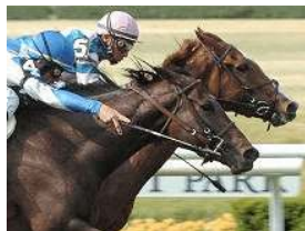
Bit of Whimsy (inside)