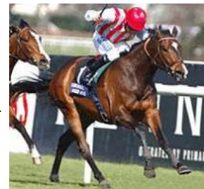
Arch Swing