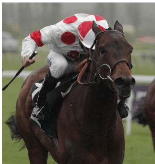
Red Evie at Newbury