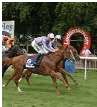
Sakhee's Secret