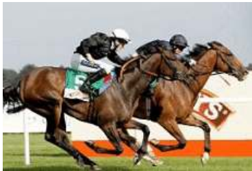
The 2006 Irish Champion finish