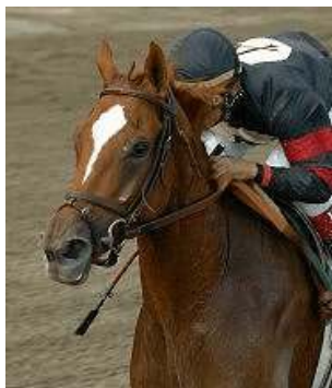
Ginger Punch