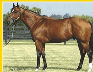
Leading Freshman Sire POSSE , sold by Denali at Keeneland