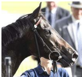
Red Clubs