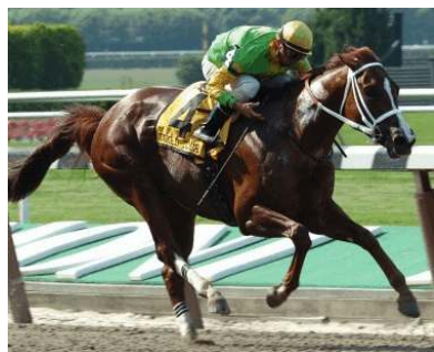
Take D'Tour

Take D'Tour has really made a name for herself going one turn at Belmont Park. The chestnut rattled off consecutive victories over Big Sandy in last year's GII Shuvee H. and the