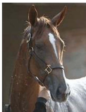
Dreaming of Anna

Champion Dreaming of Anna has won her last two on turf, including a game last-out score in the Virginia Oaks July 21 at Colonial Downs. She faces a pair of