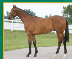
Hip 380 colt by Theatrical (IRE) o/o Miasma (Lear Fan)

977 Harp Innis, Lexington, KY 40511 Phone: (859) 293-6190 E-mail: info@monticule.com