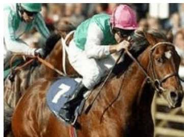
Oasis Dream (GB) bbcspport.com

I'm pleased to say that a good number of 2007's first-crop sires have managed to impress before the sales merry-go-round reaches full speed. Labor Day saw