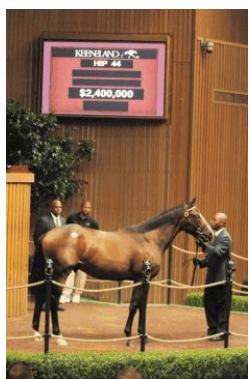
Hip 44

Lane's End and the Niarchos family have shared a close relationship over the years. The Versailles nursery has boarded mares for the powerful European-based operation for over 25 years and stands a pair of its former runners, the superb racehorse and sire Kingmambo and his younger half-brother Mingun. Yesterday, Lane's End and the Niarchos