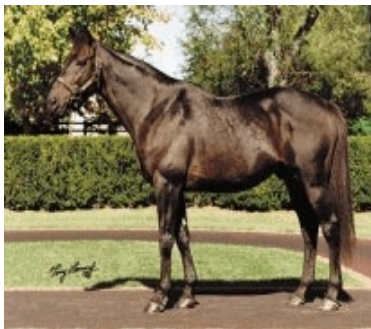
Three Chimneys Stallion, Dynaformer