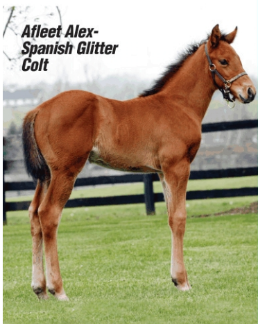
Afleet Alex- Spanish Glitter Colt