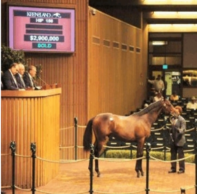
The sales topper, Hip 156