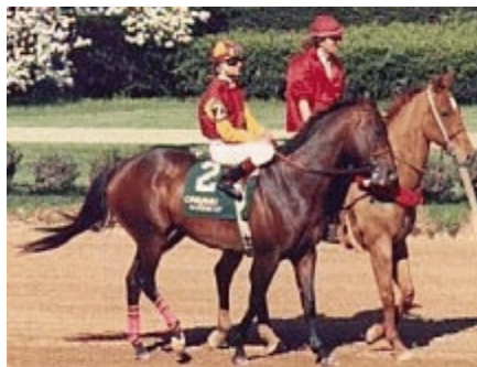
Golden Eagle MGISW Best Pal