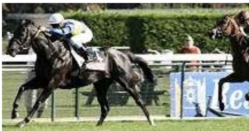
Manuduro Takes Prix Foy

10 minutes after the race he became lame and he was taken to see the specialists. It does not appear not to be life-threatening, but it does appear to be the end of his racing career. We have no idea where the injury was sustained, but unfortunately these things happen and they always seem to happen to the good ones. He's always been a very sound horse. Early in his three-year-old career he had a few little niggly problems, but nothing serious. The Baron is absolutely gutted. He's absolutely devastated and cannot put it into words. He is concerned about the horse's welfare and he is happy that the horse's life is not in any danger." Trainer Andre Fabre confirmed that the world's top-rated older performer was officially retired. "He has had a comfortable night and will have an operation on Tuesday," Fabre told sportinglife.com . "It is not life-threatening, but he will not run again. We knew there was a problem about 10 minutes after the race, as he walked around quietly and then was taken straight to the vet's box. I am afraid that's racing and, as long as there are no complications, he should remain comfortable."