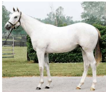
1st Crop TAPIT -Bathsheba Colt sold at Saratoga for $230,000