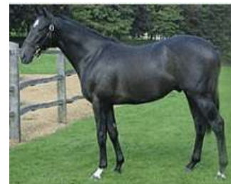
Bold Glance as a yearling Kirtlington Stud photo

Pontefract, 5.00, Mdn, £6,000, 3yo/up, 10f 6ydsT, 2:13.32, fm. + BOLD GLANCE (GB) (c, 3, Kingmambo --Last Second {Ire} {MGSW & G1SP-GB, GSW-Ire, $236,038}, by Alzao), a half-brother to Approach (GB) (Darshaan {GB}), SW & GSP-GB, GSP-US, $187,890; and Aussie Rules (Danehill), G1SW-Fr & US, GSW-GB & GSP-Ire, $875,309, topped the 2005 TATOCT sale at 1.25-million guineas. The grey colt raced in third through the early fractions of this belated first at-bat. Shuffled back to fourth at the three-furlong marker, the 8-1 chance responded under continued urging in the straight to assert by a half-length from odds-on stablemate Abydos (GB) (King's Best). Among the stars under his second dam Alruccaba (Ire) (Crystal Palace {Fr}) are Group 1 winners Alborada (GB) (Alzao), Albanova (GB) (Alzao), Quarter Moon (Ire) (Sadler's Wells) and Yesterday (Ire) (Sadler's Wells). Lifetime Record: 1-1-0-0, £3,886. O-Godolphin; B-Belgrave Bloodstock Ltd; T-Saeed bin Suroor.