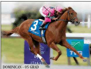
DOMINICAN - 05 GRAD

This newspaper may not be reproduced in any form or by any means, electronic or mechanical, without prior written permission of the copyright owner, MediaVista. Information as to the American races, race results and earnings was obtained from results charts published in Daily Racing Form and utilized here with the permission of the copyright owner, Daily Racing Form.