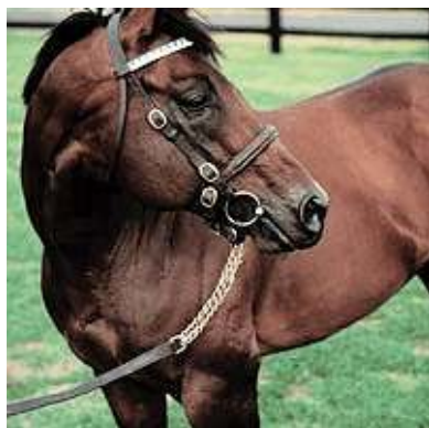
Elusive Quality www.darleyamerica.com

Darley announced yesterday that Elusive Quality (Gone West--Touch of Greatness, by Hero's Honor) will be one