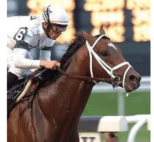
Any Given Saturday