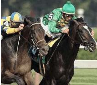
Grasshopper (right)