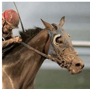
Brass Hat

Brass Hat (Prized), looking to put two lackluster efforts at Saratoga behind him, will shoulder highweight