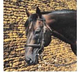
Royal Applause

There's a temptation to think that horses which mature quickly will ultimately pay the price for possessing precocious speed. However, Acclamation's immediate ancestors--far from burning themselves out--trained on very well. Royal Applause proceeded to win the G2 Gimcrack S. and G1 Middle Park S. during an unbeaten juvenile campaign and returned to his best at four, when he was Europe's champion sprinter. Princess Athena went on to be placed at three and four in the G3 King George S. over Goodwood's fast five furlongs. In this tale of coincidences, Princess Athena's sire Ahonoora and broodmare sire Floribunda also contested the King George, winning in 1961 and 1979, respectively. Put another way, Acclamation's background is one of speed, speed and more speed, mixed with a degree of durability.