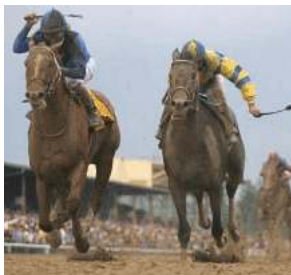
Curlin Winning Pimlico's Preakness S.