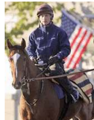
George Washington