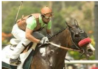
Lava Man