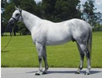
Maria's Mon