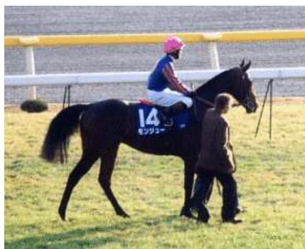
Montjeu at the 1999 Japan Cup

It was a case of honors shared between Montjeu (Ire) and Galileo (Ire) after a formidable opener to the Goffs Million Sale yesterday, which witnessed colts by both