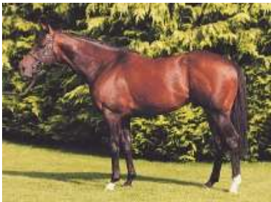
Invincible Spirit