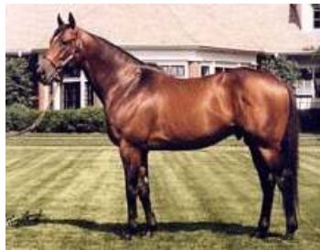
Smart Strike

There can be no doubt that the stallion performance of the weekend belonged to the unstoppable Smart Strike, who moved to the head of the general sires' list courtesy of his sensational sequence of Grade I victories from Fabulous Strike, English Channel and Curlin. For good measure, these wins were preceded by another stakes victory by the unbeaten juvenile filly Smarty Deb. If Smart Strike can maintain this momentum, he stands an excellent