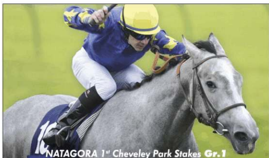
NATAGORA 1 st Cheveley Park Stakes Gr.1