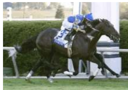
Purim winning the Shadwell