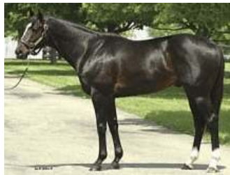
Dromoland Farm's Eurosilver