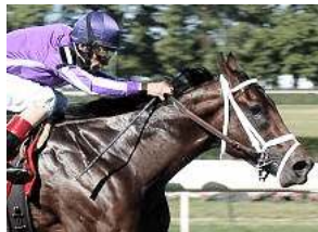
The Leopard

Storm Cat (Storm Bird--Terlingua, by Secretariat), who has stood at a fee of $500,000 since 2002, will stand the 2008 season for $300,000. The 24-year-old stallion stands at Overbrook Farm. Yearlings by the vaunted stallion sold for an average of $544,038 this year, falling from $1,255,400 a year ago. To date, Storm Cat has sired 96 graded stakes winners, eight champions