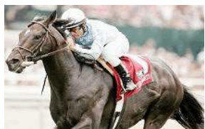
After Market

A.P. INDY STAYS AT $300K Lane's End yesterday announced stud fees for its stallion roster, which will include multiple Grade I winner After Market (Storm Cat--Tranquility Lake, by Rahy), who retires to the Versailles nursery after the end of this racing season.