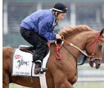
Lawyer Ron