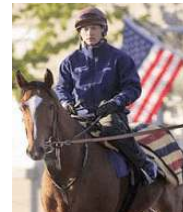
"Gorgeous George"