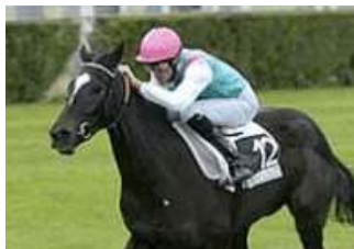
Passage of Time