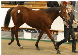
Lot 1263 tattersalls.com

NAYEF FILLY TOPS AT TATTS Book two of Tattersalls' October Yearling Sale concluded last night in Newmarket, posting a 23,907,500gns aggregate, up 18 percent on 2006; a 50,544gns average, up 15 percent; and a 35,000gns median, which rose by three percent. Hamdan Al Maktoum's Shadwell Estates was