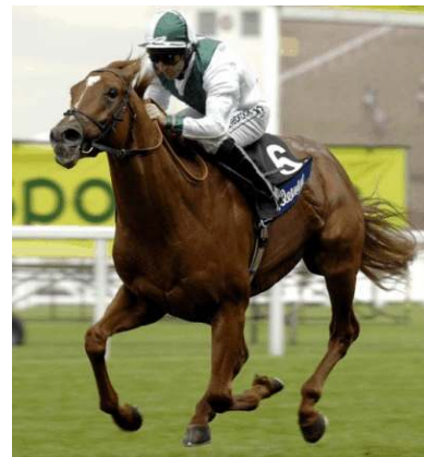
Raven's Pass

wanted to hear. The trainer of Stonerside Stables' G3 Solario S. winner Raven's Pass (Elusive Quality) was lamenting his luck yesterday. "We could have done without the rain," he said. "When we worked on the ground last Sunday, Jimmy Fortune said it was on the slow side of good. Of course, it will dry and we are going to be on a fresh strip, but we are looking at good to soft. It is autumn now and it's not going to dry out that fast, but Raven's Pass is in good form." Another conditioner who did not welcome the rain was Mick Channon, who may swerve the contest with Sheikh Ahmed bin Rashid Al Maktoum's G2 Superlative S. winner Hatta Fort (GB) (Cape Cross {Ire}). "There's no doubt he was hating the ground at Longchamp [when fourth in the G1 Prix Jean-Luc Lagardere] and I don't see any point in running him on it again," he commented. "In the circumstances he ran a cracker and even though this looks the best colts' race of the season, he won't be far away if he does take his chance. He's a fresh horse and his work has been of a consistently high level."