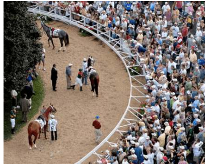
Monmouth Walking Ring

A total of 141 horses were pre-entered yesterday for the 11 races of the $23-million Breeders' Cup World Championships next weekend at Monmouth Park. Of those, nine were entered for the $5-million GI Breeders' Cup Classic, including the five best three-year-olds in