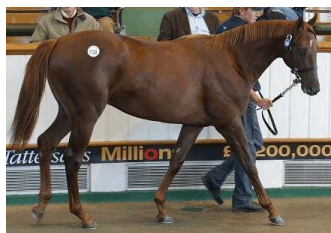
Lot 1128 tattersalls.com