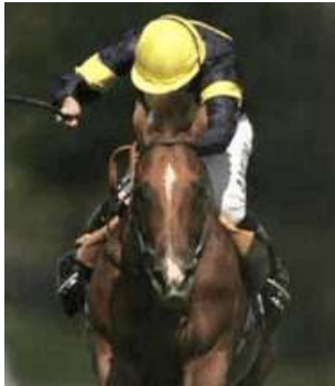
Notnowcato