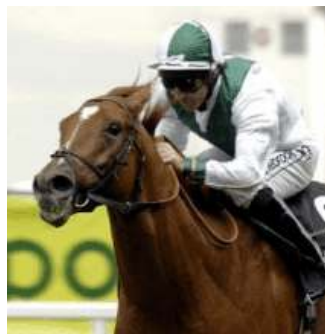
Raven's Pass