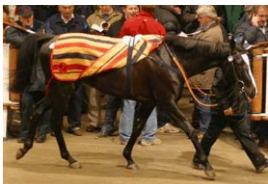
Short Skirt Selling