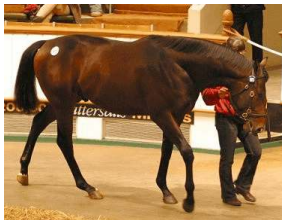
Lot 1873