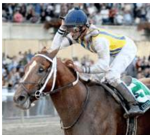
Curlin