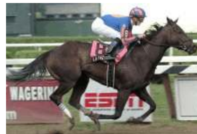
La Traviata