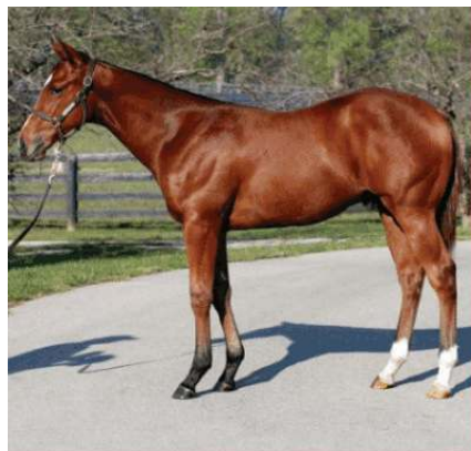
Afleeet Alex-My Sweet Country Colt Hip 1291 Keene.Nov.