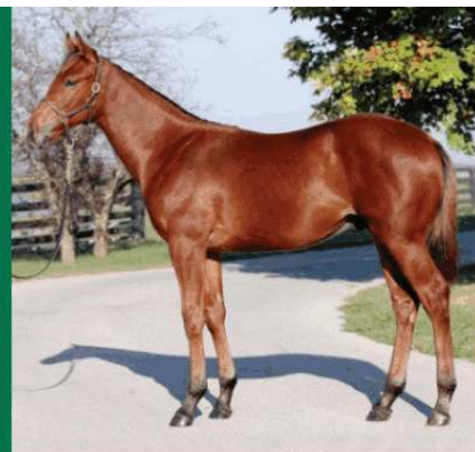
Afleeet Alex-Spanish Glitter Colt Hip 1369 Keene.Nov.

GAINESWAY Power. Passion. Performance. 859-293-2676 www.gaineway.com