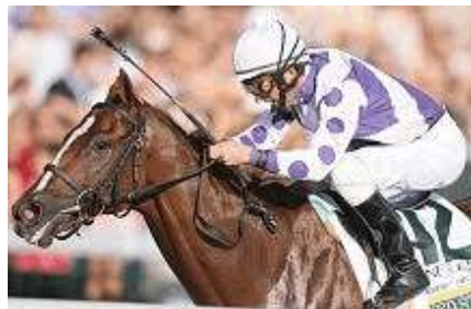
Wicked Style