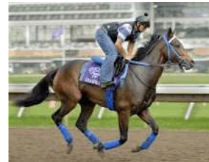
Izarra