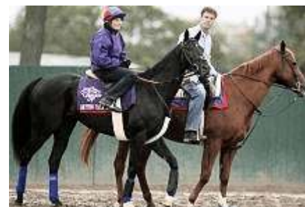
Better Talk Now