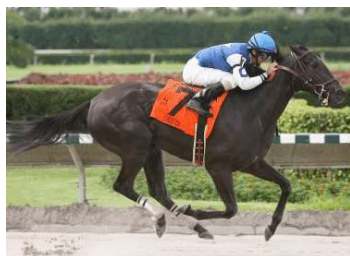
Sheets

Sheets defeated Sindy With an S in the GIII Azalea BC S. in the slop at Calder July 7. Fourth in the Aug. 4 GI Darley Test S., the dark bay comes here off a fifth to her elders in the GIII Engine H. Sept. 8 at Delaware. Sindy With an S went back to California and ran second in the CERF H. Sept. 5 at Del Mar, but flew back east and won the Oct. 6 Safely Kept BC S. at Laurel. Intentional Fever , a stakes winner