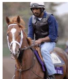
English Channel

English Channel (Smart Strike--Belva, by Theatrical {Ire}), winner of Saturday's GI Breeders' Cup Turf, will join the stallion roster at Hurricane Hall in Lexington for