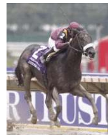
War Pass

The first relevant aspect of his pedigree is that he's by Cherokee Run, winner of the GI Breeders' Cup Sprint as a four-year-old in 1994. This alone could set the alarm bells ringing about War Pass's prospects of staying a fast-run mile and a quarter, but nothing is ever quite straightforward in Thoroughbred racing. A few other stallions which featured in the GI BC Sprint have made an impact on the Triple Crown. Smile, winner of the '86 Sprint after finishing second a year earlier, ranks as the broodmare sire of Smarty Jones, winner of the first two legs of the Triple Crown, even though he was by another sprinter Elusive Quality. And Gulch, the 1988 winner, sired Thunder Gulch, hero of the 1995 Kentucky Derby and Belmont.