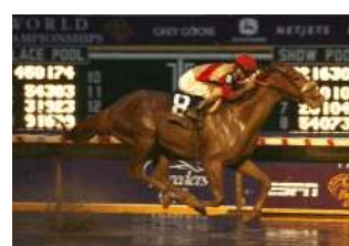
Corinthian winning the BC Dirt Mile