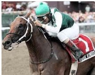
Kodiak Kowboy

On June 17, at 4:34 p.m. Eastern Time, the gates sprang open at Woodbine for the $125,000 Victoria S. It took less than a minute (:59.44, to be exact) for a