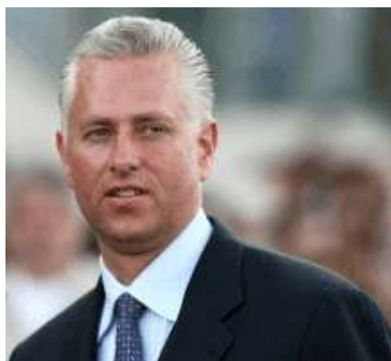
Todd Pletcher

Todd Pletcher, Eclipse Award-Winning Trainer: