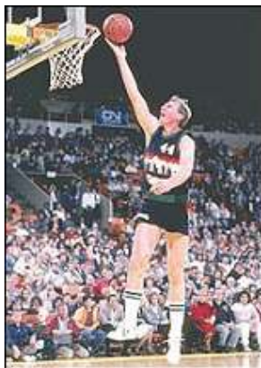
Dan Issel