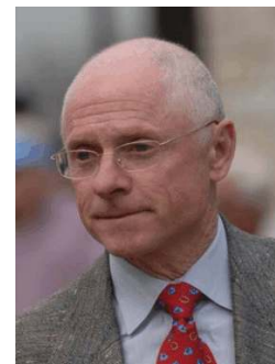
Chris McCarron

I thought it was fabulous. The only thing I'd like to see is more races added on Friday. I think a few more categories would be great--for me, the more the merrier. I think for everybody concerned, it makes sense. It's not just good for the participants of racing, but for the fans, too. I think we've got a long way to go before you start watering those races down--the Breeders' Cup is very healthy. They're doing super, and as long as it continues to grow, I'd love to see more races. Cont. p14