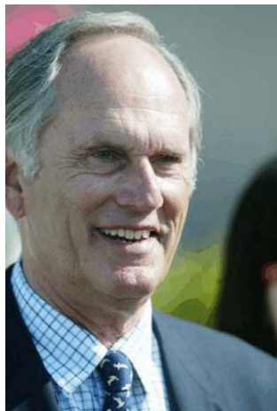
Brereton Jones

Airdrie Stud's Brereton Jones, the governor of the Commonwealth of Kentucky from 1991 to 1995, chimed in yesterday on the results of Tuesday night's gubernatorial election, in which Democrat Steve Beshear soundly defeated incumbent Republican Ernie Fletcher with 58.7 percent of the vote. "Obviously I am very pleased," Jones remarked. "I know Steve Beshear very well and he's a guy of great integrity, great ability, great heart; he's the kind of guy who has what it takes to be an outstanding governor." One issue which separated the camps in the election was the idea of the expansion of gaming in Kentucky, a notion strongly embraced by