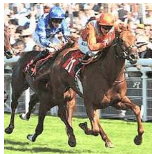
Strike the Deal