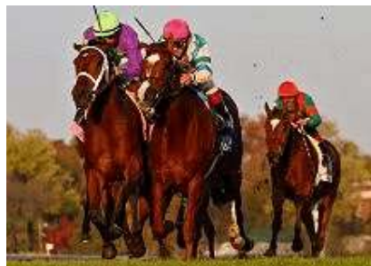
Bit of Whimsy

Bit of Whimsy earned her diploma at second asking at Aqueduct Apr. 29, then finished in a dead-heat with Rutherienne while annexing the GIII Sands Point S. at Belmont June 2. She finished a troubled fourth as the 2-1 choice in the Virginia Oaks July 21 and resurfaced with a bang-up second