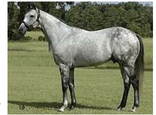
Macho Uno