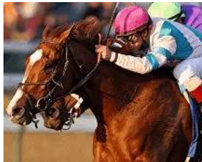
Bit of Whimsy