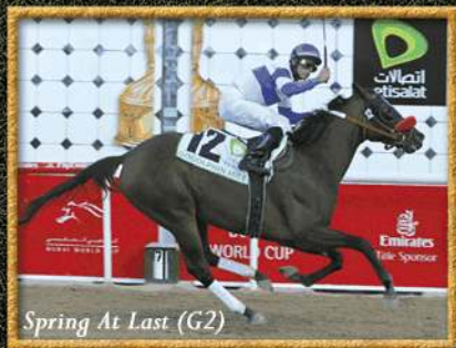
Spring At Last (G2)

In the past, WinStar sold Spring At Last, winner of the $1,000,000 Godolphin Mile (G2), at its annual racing stock reduction at Keeneland November. In 2007, WinStar is once again offering several more promising Racing and Stallion Prospects, including: