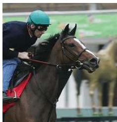
Alexander Goldrun

It almost goes without saying that Gold Away has made the most of limited opportunities. Although Alexander Goldrun was produced by Renashaan, a stakes-winning daughter of Darshaan, Renashaan was culled from the Wertheimer operation for 30,000gns while carrying her excellent daughter.