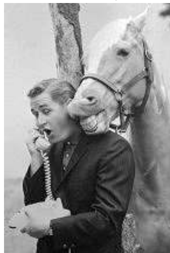
Mr. Ed and Wilbur

The heading for this column has been moved to the end, so as not to give away the answer to this guessing game. Pedigree Insights cont. p2-3