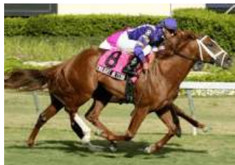
Twilight Meteor

Twilight Meteor (Smart Strike) and Mostacolli Mort (Hold For Gold) have been supplemented to the GI Hollywood Derby Nov. 25 at a cost of $10,000 each. The Todd Pletcher-trained Twilight Meteor is coming off