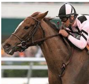
Naissance Royale