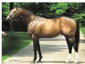
Stormy Atlantic