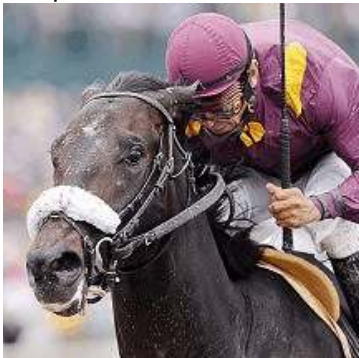
War Pass

Undefeated two-year-old War Pass (Cherokee Run--Vue, by Mr. Prospector), who likely clinched the Eclipse Award with his decisive victory in the