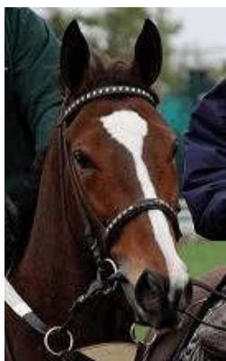
Nashoba's Key Sherackatthetrack