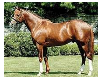
Van Nistelrooy

Eshaarat (GB) (Zafonic--Tafrah {Ire}, by Sadler's Wells), a seven-year-old mare in foal to Southern Image, topped Friday's session at the Keeneland November Breeding Stock sale at $220,000. Lakeview Stud purchased the mare from the consignment of Gainesway, agent for Stonestreet Thoroughbred Holdings LLC. Eshaarat, consigned as hip 4330 , is the dam of the two-year-old Untitled Blues (Stravinsky), who placed second in this