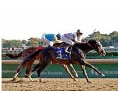
Court Vision beats Halo Najib in the Iroquois Reed Palmer

No fewer than four horses with their sights set on Saturday's co-feature took to the Churchill main track yesterday morning for their final serious drills. WinStar Farm's Court Vision (Gulch), the half-length winner of