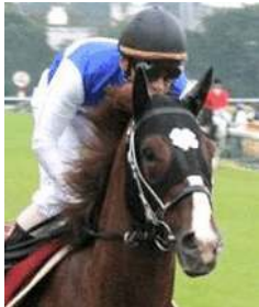
Daiwa Major

Once again stamping himself the champion miler in Japan, Daiwa Major (Jpn) (Sunday Silence) yesterday held off the late charge of Super Hornet (Jpn) (Rodrigo de Triano) to win the G1 Mile Championship at Kyoto for the second straight year. The chestnut kicked off 2007 with a third-place finish in the G1 Dubai Duty Free S. in March, then returned home and, after a break, captured the June 3 G1 Yasuda Kinen. Back on the bench after finishing 12th in the Oct. 28 G1 Takarazuka Kinen, he was third in the Oct. 7 G2 Mainichi Okan,