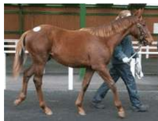
Lot 282

A colt by Verglas (Ire) was the highlight of the second session of the Goffs November Foal Sale yesterday when selling for €60,000. Consigned by Collegelands