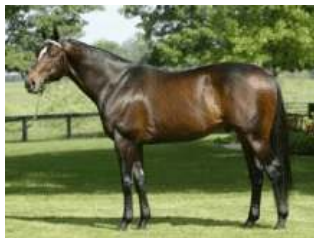
Empire Maker