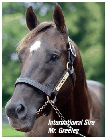
International Sire Mr. Greeley