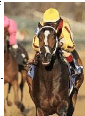
Tiz Wonderful