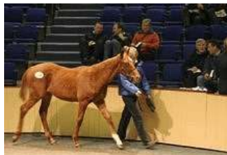
Lot 1248 - Galileo colt www.goffs.com

GALILEO GALA AT GOFFS Galileo (Ire) was a champion on the racetrack and is now one of Europe's best young sires, can do no wrong, and Coolmore's heir apparent to Sadler's Wells was firmly in the spotlight again during yesterday's final foal session of the Goffs