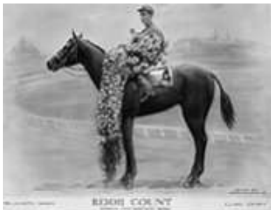
Reigh Count

The Kentucky Jockey Club S., named for the original holding company of Churchill Downs, was run at the distance of one mile before being changed to the current distance in 1980. Established in 1920 as the track's main steppingstone to the GI Kentucky Derby, it