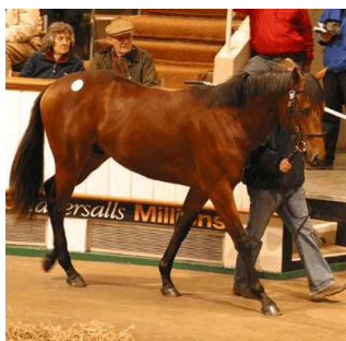
Lot 217 Tattersalls