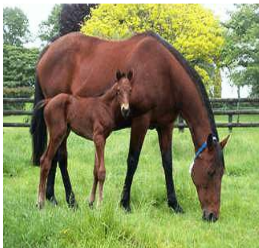
TDN PHOTO OF THE DAY: Champion racemare Sunline (NZ) with her fourth foal, a filly by Hussonet.

Heading the three-year-old filly division was Miss Finland (Aus) (Redoute's Choice {Aus}) following wins in the G1 Crown Oaks, G1 1000 Guineas and G1 Australian Guineas against the opposite sex. Haradasun (Aus) (Fusaichi Pegasus)'s Group 1 wins in the George Ryder S. and Doncaster H. ensured he was champion three-year-old male. Haradasun has since joined Aidan O'Brien's Ballydoyle string. Earning the title for champion sire was Flying Spur (Aus), whose Group 1 winners include Forensics (Aus), Mentality (Aus) and Magnus (Aus).