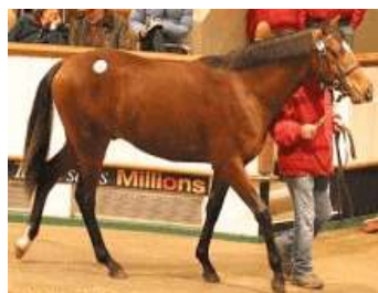
Lot 229 Tattersalls