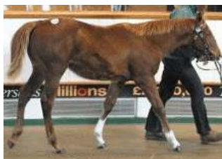
Lot 704 Tattersalls

Yesterday's low-key second session of the Tattersalls December Foal Sale in Newmarket, during which the figures and clearance rate dipped markedly from 2006, was topped by a 65,000gns filly from the first Northern Hemisphere crop of Group 1 winner Starcraft (NZ) (Soviet Star). Out of Proudfoot (Ire) (Shareef Dancer), the half-sister to Listed winner Head Over Heels (Ire) (Pursuit Of Love {GB}) was consigned