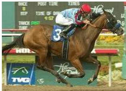
Tough Tiz's Sis

"I got into the breeding game [about 20 years ago]," the 67-year-old recalled. "I started going to Keeneland buying yearlings there. I bought a few yearlings, but I didn't have much success.