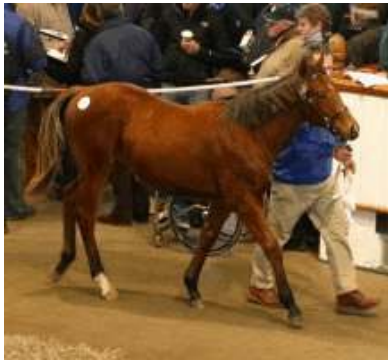
Lot 1013 www.tattersalls.com