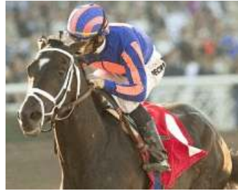
Ravel