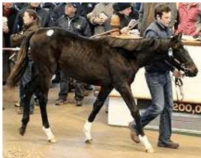
Lot 1155 tattersalls.co.uk