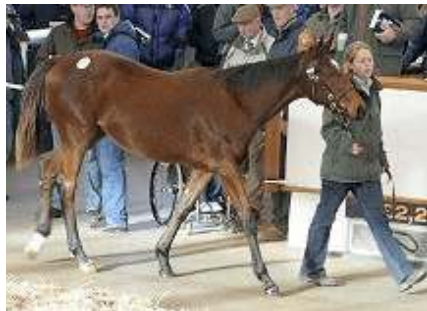
Lot 1179 tattersalls.co.uk

Irish veterinarian Demi O'Byrne bought the top four lots at yesterday's penultimate foal session of the Tattersalls December sale in Newmarket. His purchases