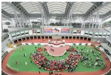
The walking ring at Sha Tin

SALE The recent outbreak of Equine Influenza in Australia has forced officials at the Hong Kong Jockey Club to split their sale of ready-to-run two-year-olds into a pair of sessions, the first of which occupies its regular slot today on the eve of the Hong Kong International Races. Through its agents, the HKJC annually pur-