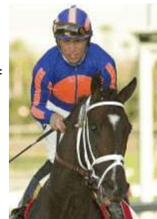
Ravel