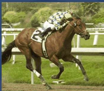
Salute the Sarge