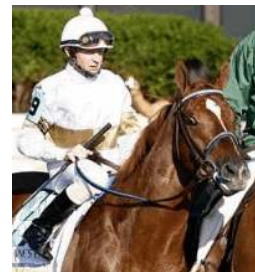
Old Man Buck