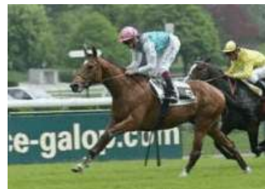
Champs Elysees