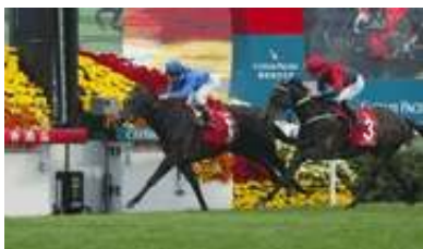
Ramonti (left) gets home

Godolphin's Ramonti (Fr) (Martino Alonso {Ire}) had covered himself in glory this season, winning a trio of the most important Group 1 races over a mile in England and finishing runner-up in two others. Some scoffed at the notion of entering the five-year-old for yesterday's G1 Cathay Pacific Hong Kong Cup over 10 furlongs, but the striking bay put pay to those naysayers, holding off a late surge from 3-10