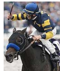
Indian Blessing