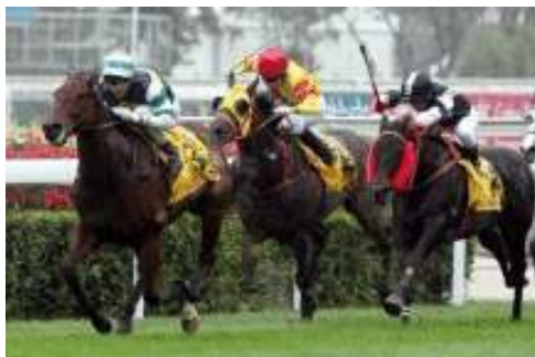
Sacred Kingdom (left) goes on to the victory

In 2003, Silent Witness (Aus) won his eighth consecutive start to claim the mantra of the world's leading sprinter. With one blemish on his record, Sacred Kingdom is only slightly less successful at this point of his career, but with his dominating victory over a talented