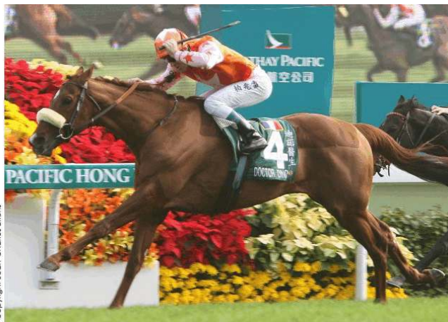
Doctor Dino, bought for €38,000 by MAB Agency

DOCTOR DINO, winner of the Gr.1 Hong Kong Vase in Sha Tin yesterday, was sold at ARQANA's Deauville August Yearling Sale.