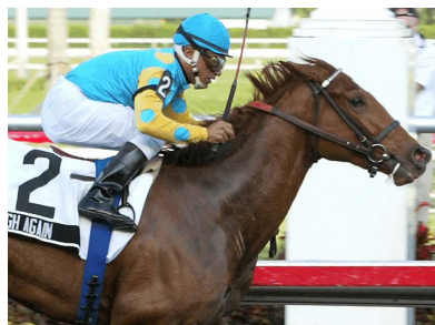
High Again

HIGH AGAIN DIES OF APPARENT HEART ATTACK Zayat Stables' graded stakes winner High Again (High Yield--Miss Belle O, by Olympio) died of an apparent heart attack during a workout at Payson Park