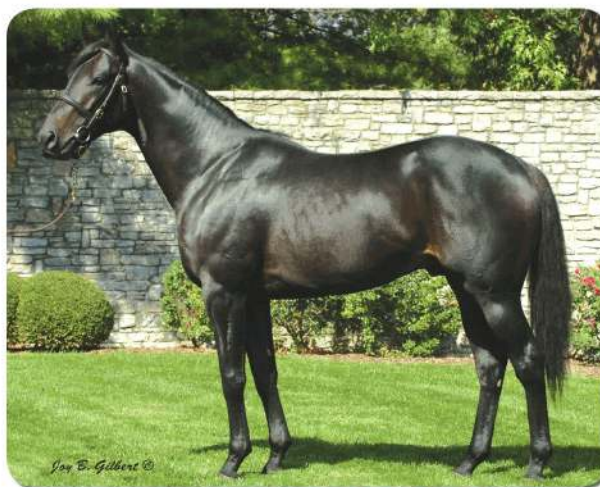
Out of 3/4 sister to STORMY ATLANTIC , Champion 2YO Sire of 2006