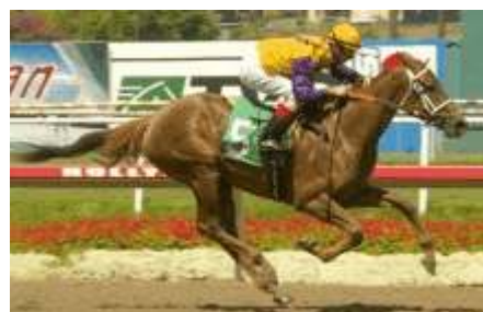
The Golden Noodle

The Golden Noodle will probably be some kind of a price tomorrow, but the chestnut has talent, for sure. Third and then second in maiden special weights at