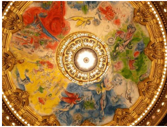
Paris Opera House Ceiling by Marc Chagall

CHAGALL (f, 3, Successful Appeal --Risky Double, by Unbridled) , an $825,000 acquisition at FTFEB, won first time out at Churchill in June of her two-year-old season and followed that with a close second in the GIII Debutante S. the next month.