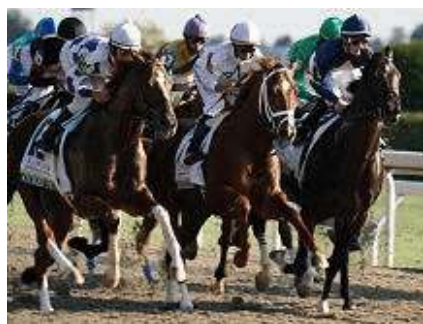
Slew's Tiznow (inside)