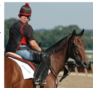
Palais Versailles

The dispersal will consist of eight broodmares, three newly turned two-year-olds and five yearlings. Among them are multiple Grade I winner Versailles Treaty (Danzig), the 19-year-old dam of GSW Saarland (Unbridled) in foal to Unbridled's Song; Versailles Treaty's 2007 filly by Empire Maker, making her a 3/4-sister to Saarland; and Palais Versailles (Pulpit), a 2004 filly out of Versailles Treaty offered as a broodmare prospect. Catalogues pages are available on