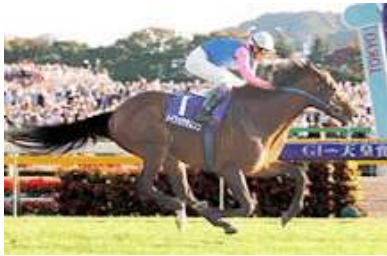
Meisho Samson

Today's G1 Arima Kinen at Nakayama Racecourse outside of Tokyo is to the Japanese what the G1 Melbourne Cup is to Aussies--it's the race that stops a nation. No single event in the world attracts more betting; even those who don't follow racing seem to find a way to make a wager. And this year's renewal looks to