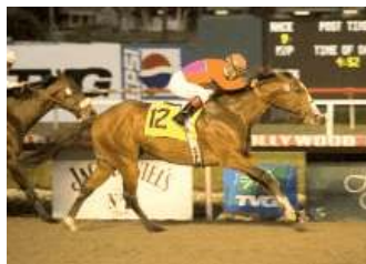
Into Mischief

Handicappers might have struggled with Into Mischief's wide draw, but the colt was smoothly away from the stalls and quick enough to the first turn to stalk the pace of Eaton's Gift (Johannesburg) through an opening quarter mile in :22.76. Massive Drama fell into a good spot just in behind the leaders, while Colonel John traveled comfortably in a centerfield position. Eaton's Gift was still the longshot leader as they raced past six furlongs in 1:10.44, but Victor Espinoza