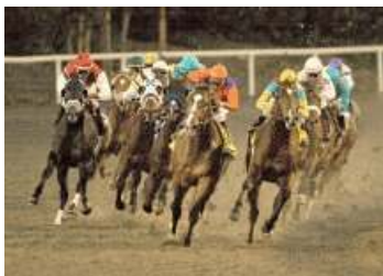
Into Mischief (center) turns for home