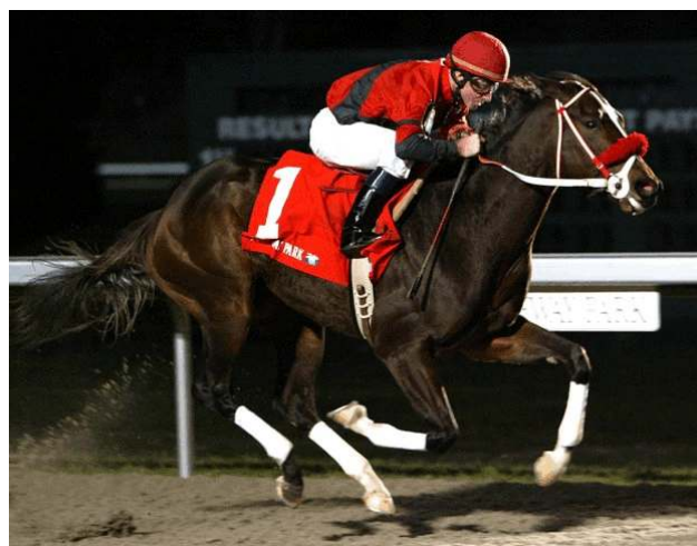
Kadira Wins Turfway's Gowell S.