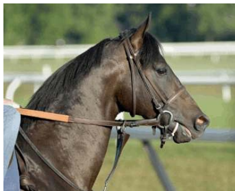
Maimonides at Saratoga

MAIMONIDES WORKING HIS WAY BACK Zayat Stables' Maimonides (Vindication), out of action since finishing third in the GI Hopeful S. at Saratoga, breezed seven-eighths at Hollywood yesterday morning, covering the distance in 1:25.40.