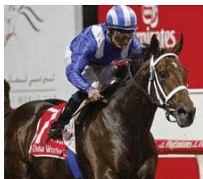
Invasor (Arg) www.shadwellfarm.com

The first foal of 2006 Horse of the Year Invasor (Arg) (Candy Stripes--Quendom {Arg}, by Interpretate {Arg})