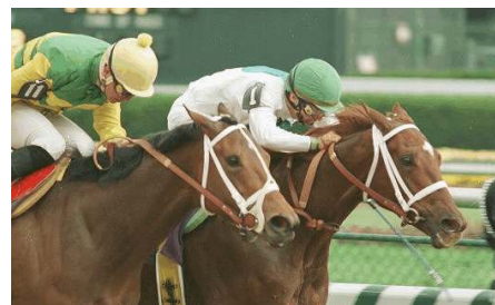
Flanders in the 1994 Breeders' Cup

As a racehorse, Flanders exemplified precocity. No other filly managed to beat the 1994 champion two-year-old filly across the finish line in five starts. The