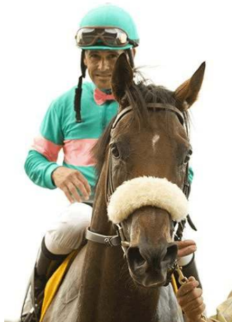
Madeo