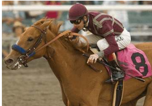
Evita Argentina

She may prove better suited to sprint racing, but that's not all bad news for Evita Argentina (Candy Ride {Arg}). The chestnut filly took the GIII Sorrento S. and