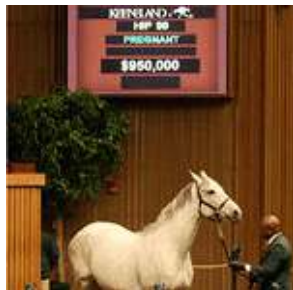
Island Fashion, one of two mares to sell for $950,000

The 2009 Keeneland January Horses of All Ages Sale wrapped up yesterday with another session of steep statistical declines, the victim of a disastrous economic crisis in all corners of the world and a catalogue which paled in quality to that of the previous year. When the dust had settled yesterday, the six-day turnover of