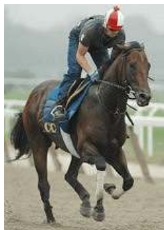
In Summation