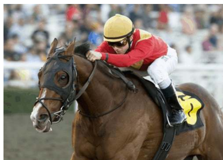
Nownownow

Nownownow has another link to Gainesway in that this colt's third dam, Riviere Enchantee, was a half-sister to Lypheor. This French Group 3 winner was sold to Japan after just one season at stud in Ireland, but that single Irish crop contained Tolomeo, winner of the 1983 Budweiser Million, and Royal Heroine, who lived up to her name in the 1984 Breeders' Cup Mile. Few stallions ever returned from Japan at that time, but Gainesway managed to return Lypheor to the West and he justified the move by siring several good winners before dying comparatively young.