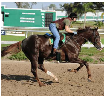
Giant Oak at Fair Grounds

A field of 13 sophomores was entered yesterday for Saturday's GIII Risen Star S. at Fair Grounds, with graded stakes-placed Giant Oak (Giant's Causeway) the 3-1 morning-line favorite. The chestnut colt was beaten just a neck when second behind Beethoven (Sky Mesa) in the Nov. 29 GII Kentucky Jockey Club S. Capt.