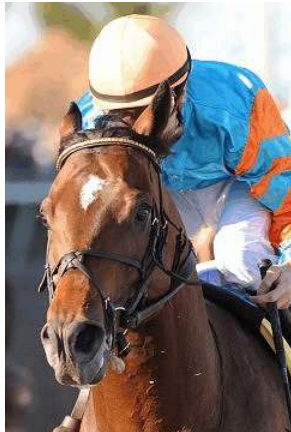
Saratoga Sinner