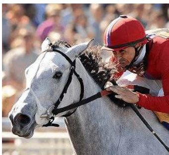
Stardom Bound

Champion Stardom Bound (Tapit) will take on eight rivals in her sophomore debut in Saturday's GI Las Virgenes S. at Santa Anita. The gray, who capped her juvenile campaign with an emphatic score in the GI Breeders' Cup Juvenile Fillies, makes her debut for IEAH Stables and partners and trainer Bobby Frankel after going through the ring for $5.7 million at FTKNOV. Century Park (General Meeting), heroine of the GIII Santa Ysabel S., Blue Norther S. winner Navigator (Stormy