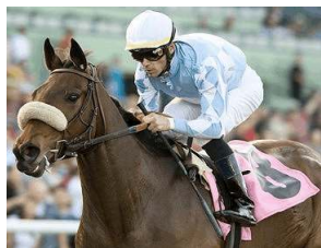
Life Is Sweet Benoit photo

⊛ "TDN Rising Star" ⊛ Life Is Sweet made it look easy when returning from an eight-month layoff in the GII El Encino S. Jan. 18. The full to champion Sweet Catomine flew past MGISW Country Star in the final furlong that day, and she's since come back to post