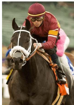
Georgie Boy

One of Ippodamia's six wins in 21 career starts was the Northwest Stallion S. at Emerald Downs during her juvenile season. She was barren the year after producing Georgie Boy as her first foal, but has a two-year-old Old Topper filly named Miss Georgie Girl, and produced another filly by Tribal Rule in 2008. Her first son's exploits earned the mare a trip to Kentucky, where she was bred to champion Street Sense (Street Cry {Ire}) last Mar. 22.