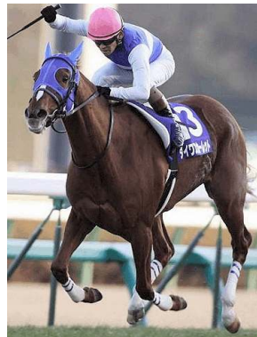
Daiwa Scarlet

Japanese star mare Daiwa Scarlet (Jpn) (Agnes Tachyon--Scarlet Bouquet {Jpn}, by Northern Taste) has been retired from racing after sustaining a leg injury over the weekend, according to the Japan Racing Association. The five-year-old had been expected to contest Sunday's G1 February S., her first test on dirt, in anticipation of a tilt at the G1 Dubai World Cup in March. Daiwa Scarlet was named Japan's champion three-year-old filly in 2007 after winning that year's G1 Oka Sho (Japanese 1000 Guineas) and G1 Queen Elizabeth II Commemorative Cup. She won last year's G1 Arima Kinen. On the board in all 12 of her lifetime starts, Daiwa Scarlet retires with eight victories and earnings of $7,390,071.