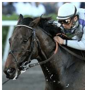
Kelly's Landing

KELLY'S LANDING RETIRED Eight-year-old gelding Kelly's Landing (Patton--Best Game, by Great Above), hero of the 2007 G1 Dubai Golden Shaheen, has been retired, according to Daily Racing Form .