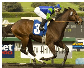
Rail Trip Benoit

Rail Trip was tabbed a ★ "TDN Rising Star" ★ following a dominant 3 1/2-length debut score in a six-furlong Hollywood Park maiden Nov. 7, then humbled entry-level allowance foes going 6 1/2 panels at the Inglewood track Dec. 20. Stretched out to 1 1/16 miles in his third start, the gelding led from gate to wire to triumph by 5 1/2 lengths, ridden out once again. Trainer Ron Ellis had considered today's GII San