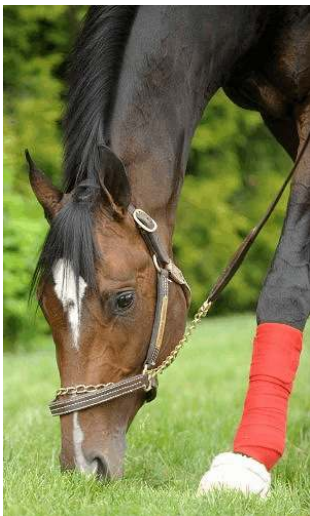
Yankee Bravo Horsephoto

Yankee Bravo (Yankee Gentleman) hasn't been out since finishing 10th in the May 17 GI Preakness S., and he faces a solid field in his return in today's GII San Carlos H. at Santa Anita. The dark bay started his career with a maiden win at Britain's Redcar in September of 2007. Shipped across the Atlantic for his second start, he took the Eddie Logan S. at Santa Anita that December by a half-length, and made it three in a row in the California Derby last January. Yankee Bravo rallied to be third in the Mar. 8 GII Louisiana Derby, then added a fourth in the Apr. 5 GI Santa Anita Derby, but lacked the graded earnings to make the field for the GI Kentucky Derby, and showed little in the Preakness. Cont. p2